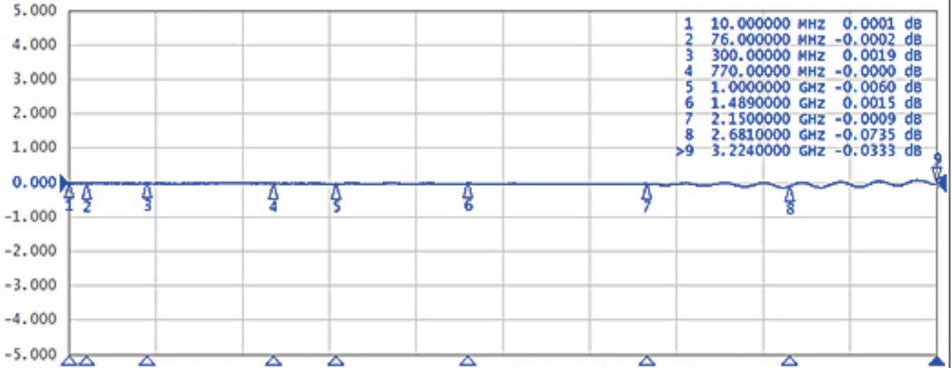
Tr1 S21 Log Mag 1.000dB/ Ref 0.000dB [F2]